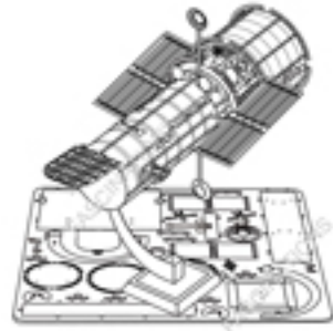
Hubble Telescope Item No. MMS093